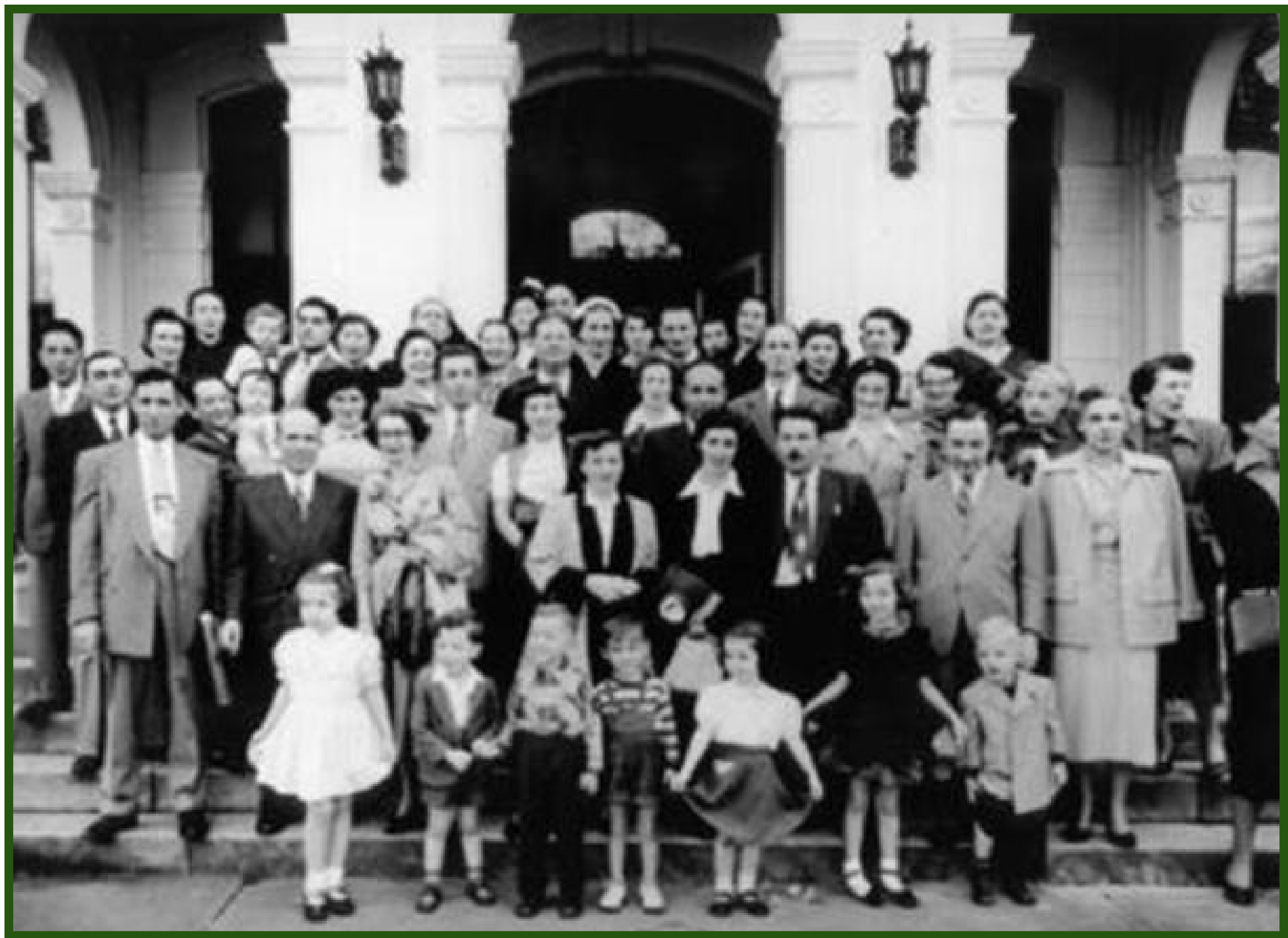
Holocaust survivors who settled in New Orleans pose on the St. Charles Avenue Jewish Community Center steps, 1949.